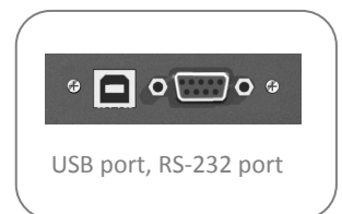
USB port, RS-232 port